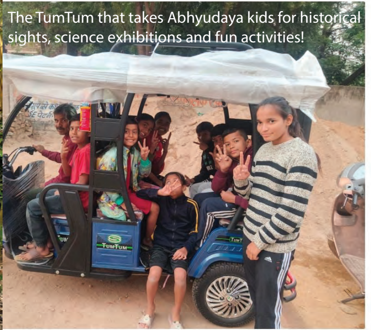
The TumTum that takes Abhyudaya kids for historical sights, science exhibitions and fun activities!