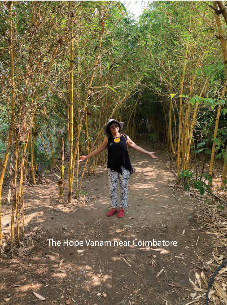
The Hope Vanam near Coimbatore